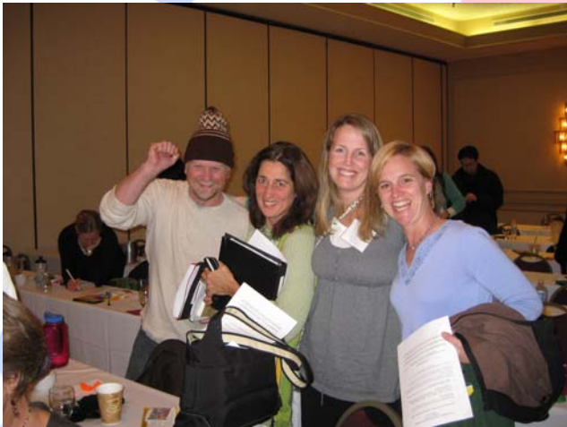
Our fearless Vermont Crew of attendees