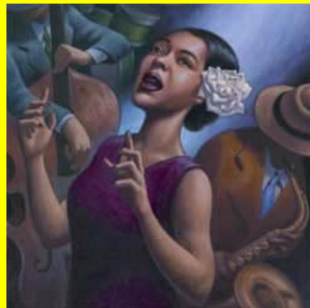
"You have your own song"