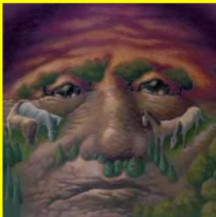
"You are a healer"

I work in a school and after reading this book am inspired to ask teachers to share who they look up to and why, to have my students read the book and pick who they would write a page about, and I've pondered who is important to me and what talents I have to share. So in this new year, may we all find time to reflect on who we honor as smart, courageous, creative, or gentle . . . may we find time to reflect on the gifts we give to others, and may we make a renewed effort to point out to each and every one of our clients the gifts they offer to their families, their communities, and themselves.