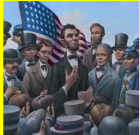
"You are part of a family"

From the book "of Thee I Sing by Barak Obama, Illustrated by Loren Long.